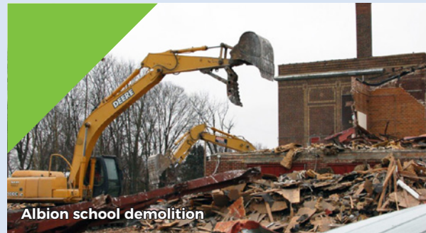
Albion school demolition

Through membership, local governments share resources they could not afford individually. To maintain membership, local governments pay annual membership dues. Fees for services are very minimal, and many services require no fee.